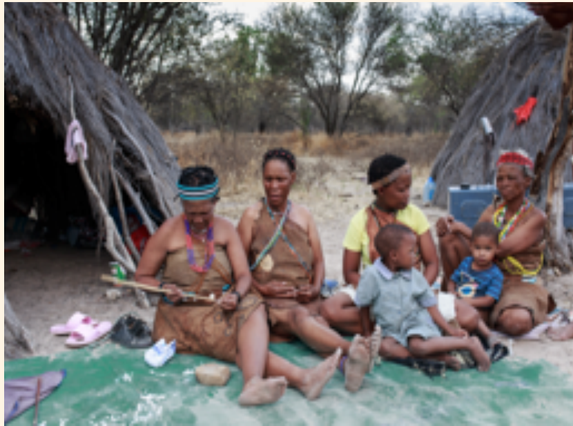
San people on September 09, 2014 in Ghanzi, Botswana: The San people (or Saan), also known as Bushmen are the first people of Africa. They live in Kalahari desert area.