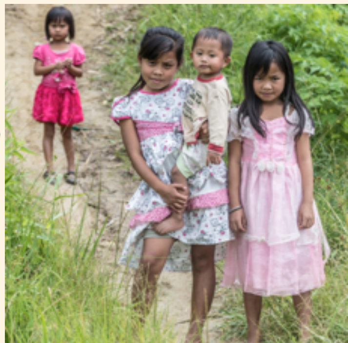
Osango, Sulawesi, Indonesia - August 17, 2014: Children of Toraja ethnicity in the countryside of Osango, Mamasa region, West Tana Toraja, Sulawesi, Indonesia