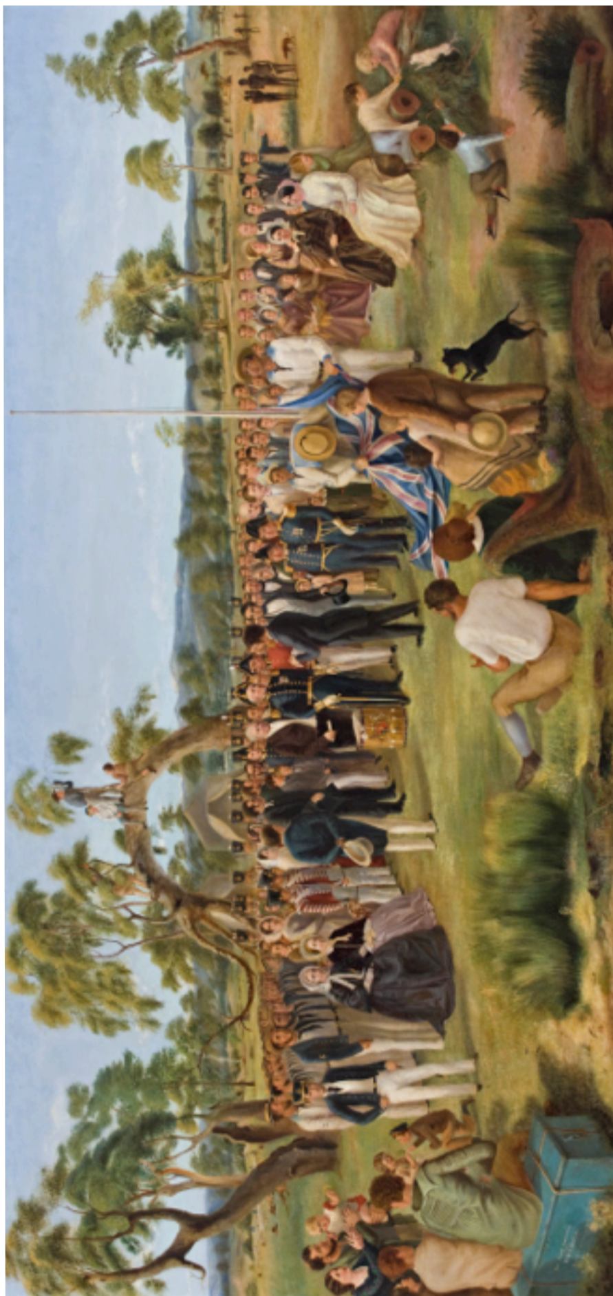
Charles Hill The Proclamation of South Australia 1836 c. 1856-76, Adelaide, oil on canvas 133.3 x 274.3 cm, Morgan Thomas Bequest Fund 1936, Art Gallery of South Australia, Adelaide