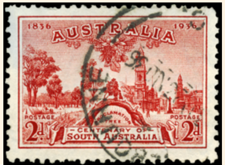
CIRCA 1936: A stamp shows the Old Gum Tree, Glenelg River, King William Street, Adelaide, Centenary of South Australia